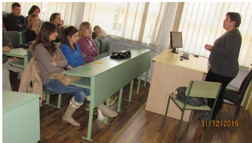
Figure 2. Students listened lecture very carefully

Students were very satisfied with the quality of lecture and expressed their satisfaction with applause. They asked about current parts of the lecture and explained dilemmas.